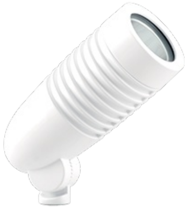
Same small package. Bigger output. Replaces 50W MR16 Floodlight. Color: White Weight: 1.5 lbs