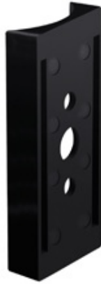
Pole adaptors for ALED Area Lights