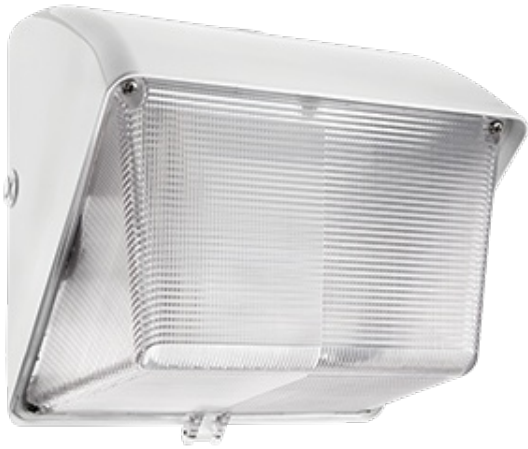
Compact Wallpack. UV stabilized, vandal resistant prismatic polycarbonate refractor. Lamp supplied.