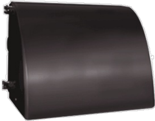
Fully shielded, Full Cutoff wallpack. Full Cutoff optics with flat tempered glass lens. EZ mount knockouts for easy wiring. Lamp supplied.