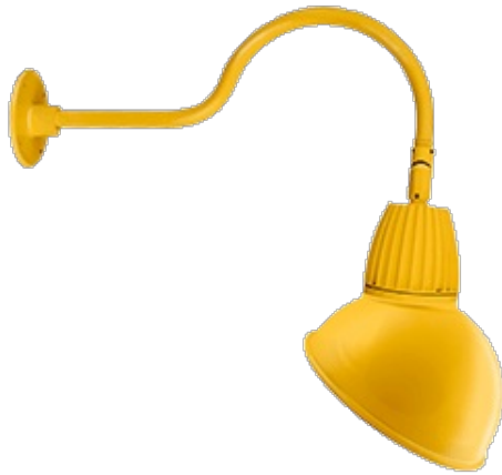
13 & 26 Watt Dome Shade LED Gooseneck Luminaire designed to match the architecture of Main Street storefronts and building perimeters. LED Gooseneck Dome Shade with 24" Goose Arm Style 1.