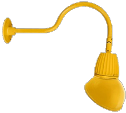
13 & 26 Watt Dome Shade LED Gooseneck Luminaire designed to match the architecture of Main Street storefronts and building perimeters. LED Gooseneck Dome Shade with 24" Goose Arm Style 1.