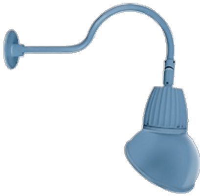
13 & 26 Watt Dome Shade LED Gooseneck Luminaire designed to match the architecture of Main Street storefronts and building perimeters. LED Gooseneck Dome Shade with 24" Goose Arm Style 1.