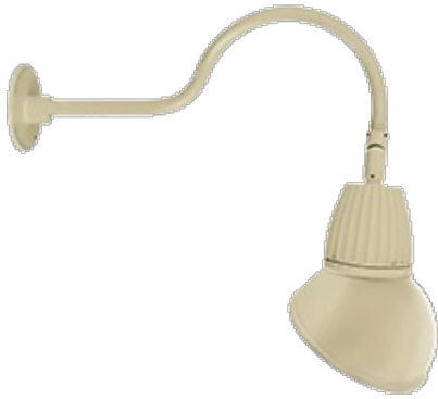
13 & 26 Watt Dome Shade LED Gooseneck Luminaire designed to match the architecture of Main Street storefronts and building perimeters. LED Gooseneck Dome Shade with 24" Goose Arm Style 1.