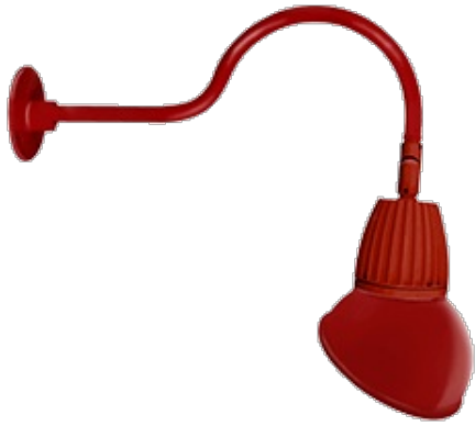
13 & 26 Watt Dome Shade LED Gooseneck Luminaire designed to match the architecture of Main Street storefronts and building perimeters. LED Gooseneck Dome Shade with 24" Goose Arm Style 1.