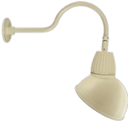
13 & 26 Watt Dome Shade LED Gooseneck Luminaire designed to match the architecture of Main Street storefronts and building perimeters. LED Gooseneck Dome Shade with 24" Goose Arm Style 1.