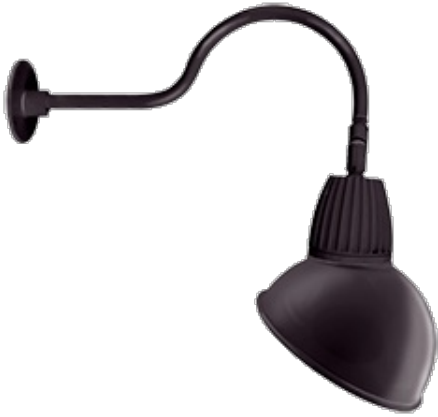
13 & 26 Watt Dome Shade LED Gooseneck Luminaire designed to match the architecture of Main Street storefronts and building perimeters. LED Gooseneck Dome Shade with 24" Goose Arm Style 1.