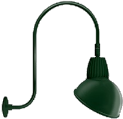
13 & 26 Watt Dome Shade LED Gooseneck Luminaire designed to match the architecture of Main Street storefronts and building perimeters. LED Gooseneck Dome Shade with Upcurve 30" High, 25" from Wall Goose Arm Style 3.