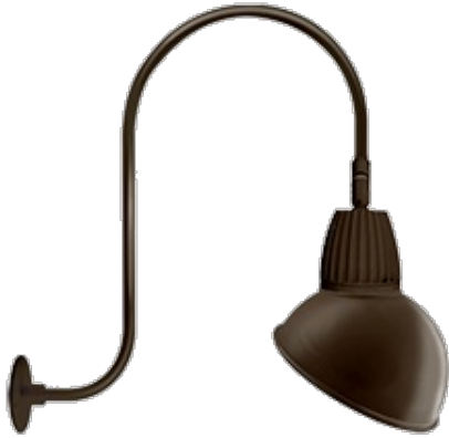
13 & 26 Watt Dome Shade LED Gooseneck Luminaire designed to match the architecture of Main Street storefronts and building perimeters. LED Gooseneck Dome Shade with Upcurve 30" High, 25" from Wall Goose Arm Style 3.