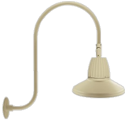
13 & 26 Watt Straight Shade LED Gooseneck Luminaire designed to match the architecture of Main Street storefronts and building perimeters. LED Gooseneck Straight Shade with Upcurve 30" High, 25" from Wall Goose Arm Style 3.