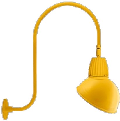
13 & 26 Watt Dome Shade LED Gooseneck Luminaire designed to match the architecture of Main Street storefronts and building perimeters. LED Gooseneck Dome Shade with Upcurve 30" High, 25" from Wall Goose Arm Style 3.