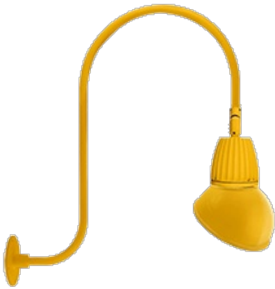
13 & 26 Watt Dome Shade LED Gooseneck Luminaire designed to match the architecture of Main Street storefronts and building perimeters. LED Gooseneck Dome Shade with Upcurve 30" High, 25" from Wall Goose Arm Style 3.