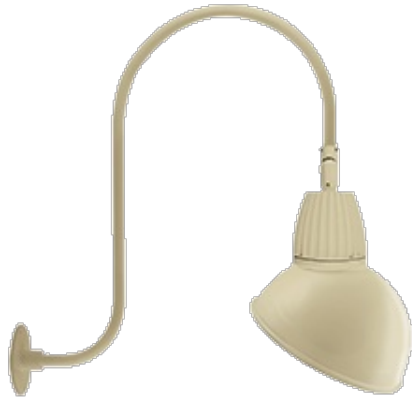
13 & 26 Watt Dome Shade LED Gooseneck Luminaire designed to match the architecture of Main Street storefronts and building perimeters. LED Gooseneck Dome Shade with Upcurve 30" High, 25" from Wall Goose Arm Style 3.