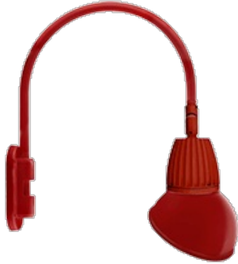
13 & 26 Watt Dome Shade LED Gooseneck Luminaire designed to match the architecture of Main Street storefronts and building perimeters. LED Gooseneck Dome Shade with Wall 20" High, 19" from Wall Goose Arm Style 4.