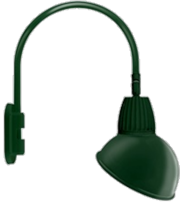
13 & 26 Watt Dome Shade LED Gooseneck Luminaire designed to match the architecture of Main Street storefronts and building perimeters. LED Gooseneck Dome Shade with Wall 20" High, 19" from Wall Goose Arm Style 4.