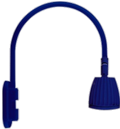
13 & 26 Watt No Shade LED Gooseneck Luminaire designed to match the architecture of Main Street storefronts and building perimeters. LED Gooseneck No Shade with Wall 20" High, 19" from Wall Goose Arm Style 4.