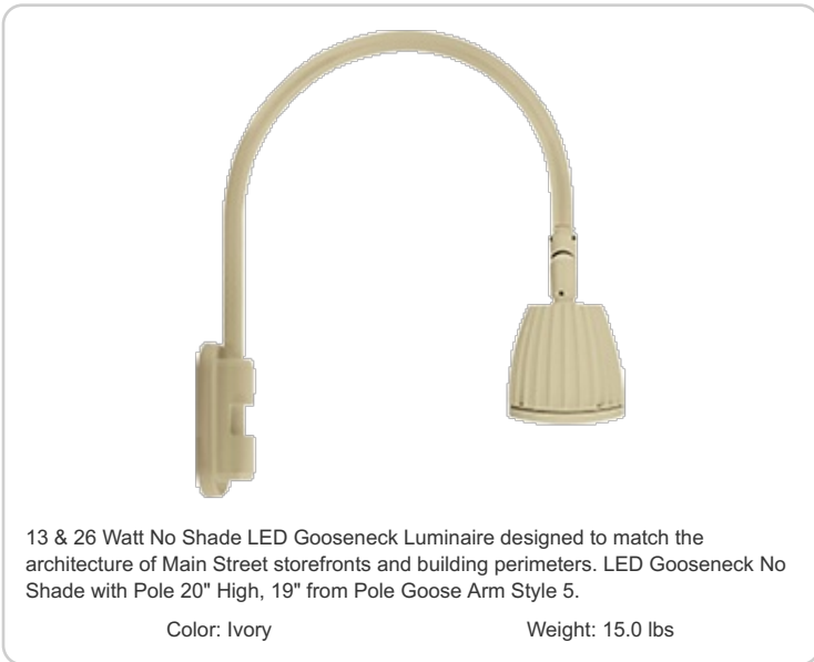
13 & 26 Watt No Shade LED Gooseneck Luminaire designed to match the architecture of Main Street storefronts and building perimeters. LED Gooseneck No Shade with Pole 20" High, 19" from Pole Goose Arm Style 5.