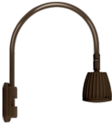
13 & 26 Watt No Shade LED Gooseneck Luminaire designed to match the architecture of Main Street storefronts and building perimeters. LED Gooseneck No Shade with Pole 20" High, 19" from Pole Goose Arm Style 5.