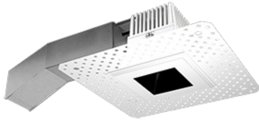
2" deep regress downlight delivers higher lumen output and reduces glare. Color: White trim black cone Weight: 2.9 lbs