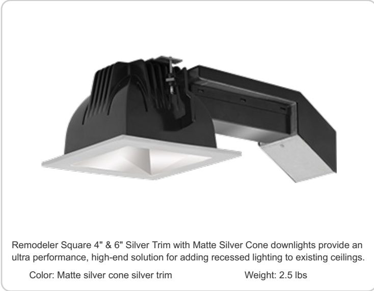
Remodeler Square 4" & 6" Silver Trim with Matte Silver Cone downlights provide an ultra performance, high-end solution for adding recessed lighting to existing ceilings.