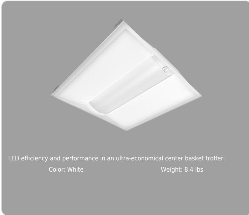
LED efficiency and performance in an ultra-economical center basket troffer. Color: White Weight: 8.4 lbs