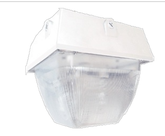
VAN5 12" x 12" Emergency Battery Backup. 2x 32W CFL or 2x 42W CFL. Available in 120V or 277 volts. Emergency battery operates only one lamp. Lamp supplied.